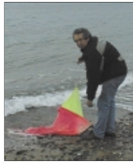
GD3YXM retrieves an extremely bedraggled kite from the sea.

We spent a few hours purchasing provisions and enjoyed a proper meal in a restaurant before returning to the Point of Ayre to get the station ready for David's 73kHz exploits on Sunday. After dark, we returned to the shore car park, installed the earth and launched the kite. Again we had contacts including IK5ZPV, I5MXX, DK8KW,