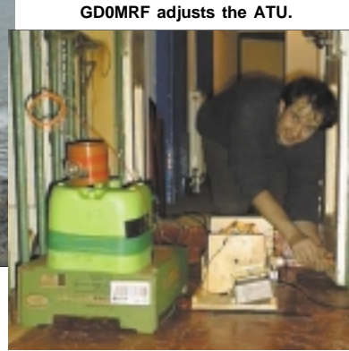
GD0MRF adjusts the ATU.