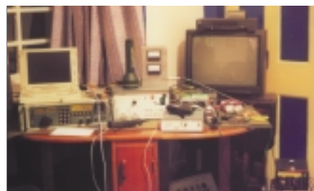
There was no shortage of gear in the shack.